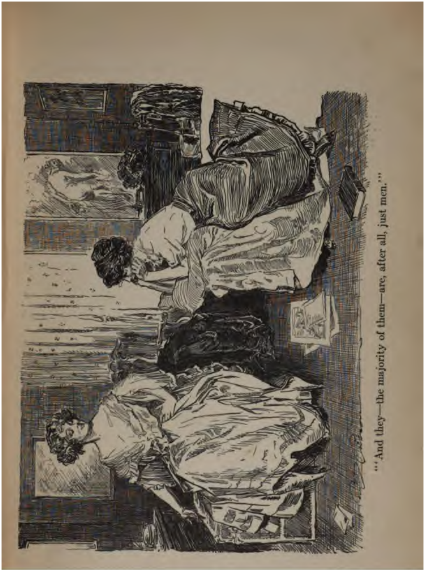
“... And they—the majority of them—are, after all, just men.”